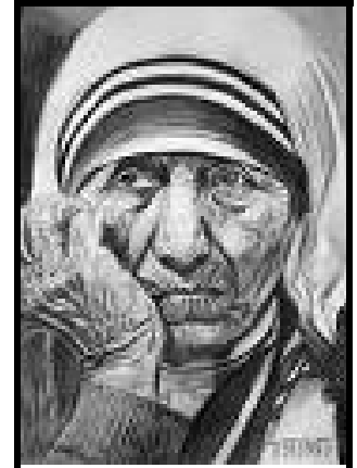
Concerned for the poor.

"BECAUSE GOD SEES OUR PURPOSES AS EQUAL"